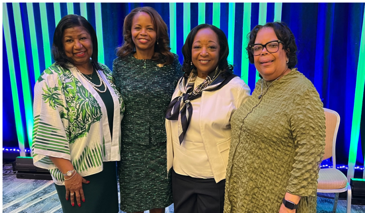
GGEU members at the Eastern Area Conference of The Links, Incorporated in Pennsylvania, PA.