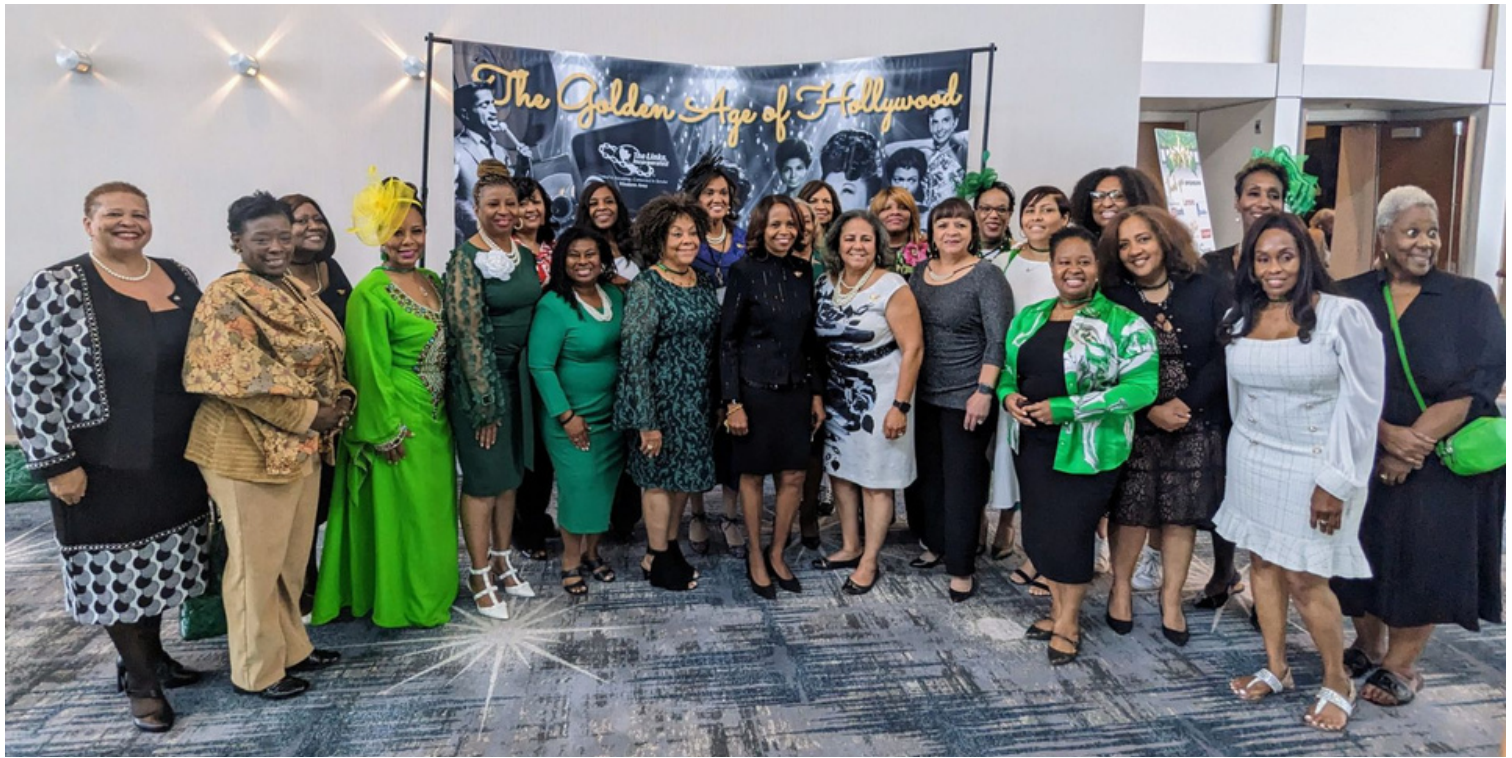
GGEU members at the Western Area Conference of The Links, Incorporated in Los Angeles, CA.